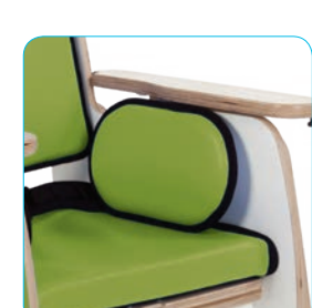
25mm Side Pad (Pair) 135-X635-AA 50mm Side Pad (Pair) 135-X654-AA