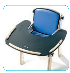
Depth Adjustable Activity Tray 135-X620 Tray Pad (Not shown) 135-X656