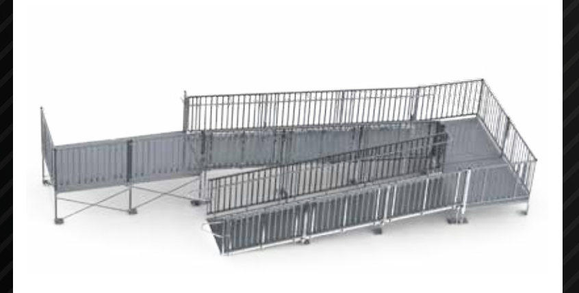
Turnback system with picketed guards and top platform