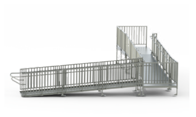
Ninety-degree turn with picketed guards and platform