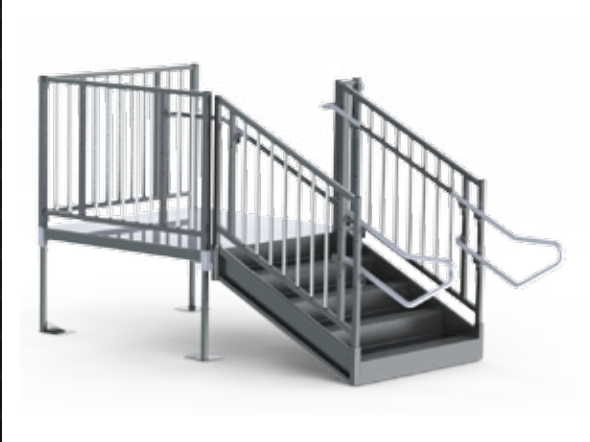
Step system with picketed guards