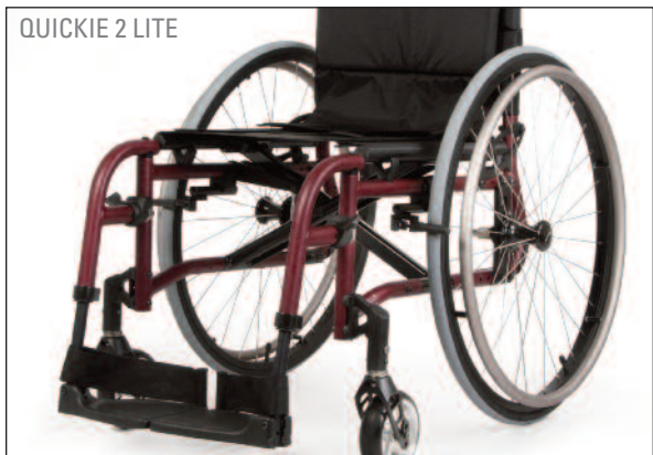
QUICKIE 2 LITE

The QUICKIE 2 uses Q-Fit Technology to create a tight fit between components for a snug, out-of-the-box feel over the lifetime of the wheelchair. Living springs in the side guards and padded swing-away arms eliminate wiggle and rattling, while reversible seat saddles lock the seat rails in place for a smooth, rigid ride.