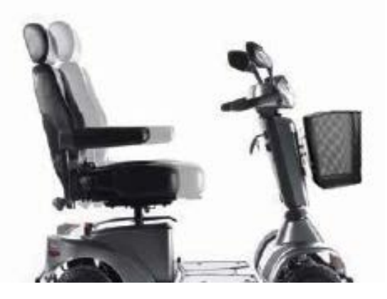
→ Infinite seat depth adjustment