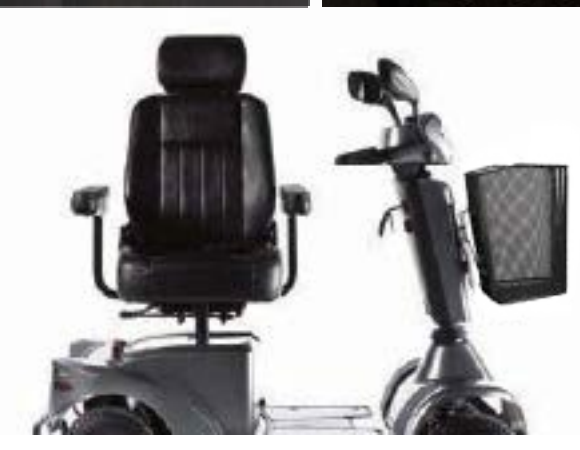
→ Seat rotation enables comfortable transfers