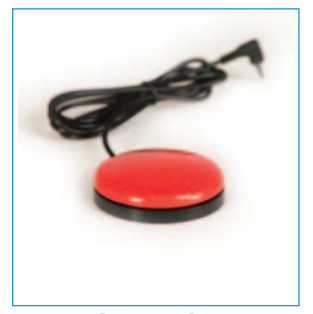
2.5" Single Switch black, blue, green, red, yellow

Individual remote switches for individual access. SWITCH-IT provides a number of different individual switches, which can be used as inputs for drive control systems or other functions.