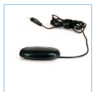
Egg Switch black, blue, green, red, yellow