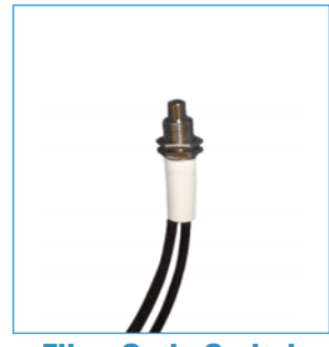
Fiber Optic Switch