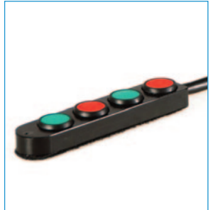
Mini 4 Button