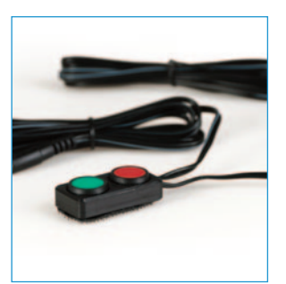
Mini 2 Button