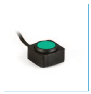
Mini 1 Button blue, green, red