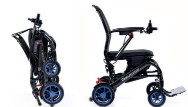
Q50 R Carbon

Travel lighter with the 32 lbs carbon folding powerchair.