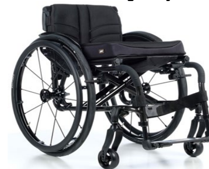
QS5 X - Fixed Front